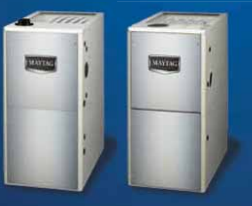
M1200 Two-Stage, Fixed-Speed Heating Comfort